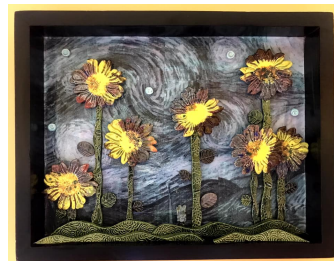
Swirly Night clay-relief by Denise Delongis- Chesky

April 30 (2:30-4:30) student art delivery