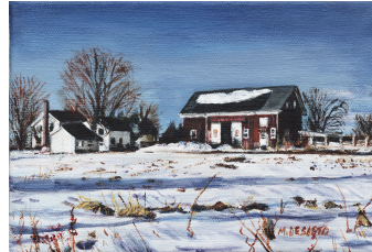
Barker Farm